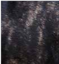
Brindle Pattern (varies)