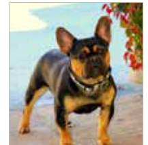
Black and Tan

Isabella (like in a Doberman), Black and tan